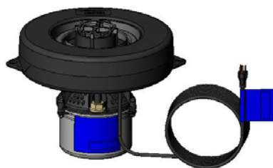
1400JF Without Lights

Assembly and Installation of Kasco equipment is quick and easy. Each unit includes an Owners Manual with specific steps to assemble, install, and operate the equipment properly.