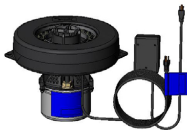
1400JFL With Lights

The motor unit attaches to the float using stainless steel hardware for a secure assembly. The single section, U.V. resistant, high density thermoplastic float allows for excellent durability with an attractive shape and low visibility. The rigid polypropylene fountain housing helps protect the unit from debris and reduce the likelihood of clogging.