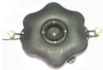
2 Light Kit Orientation on Float