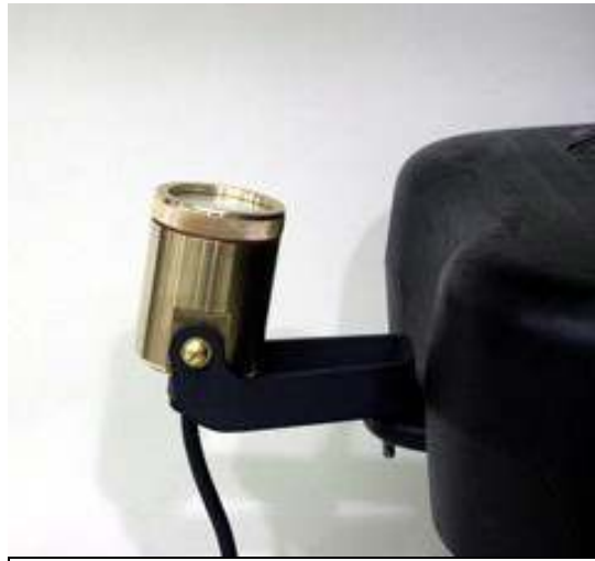
Bronze Light Attached to Single Piece Float