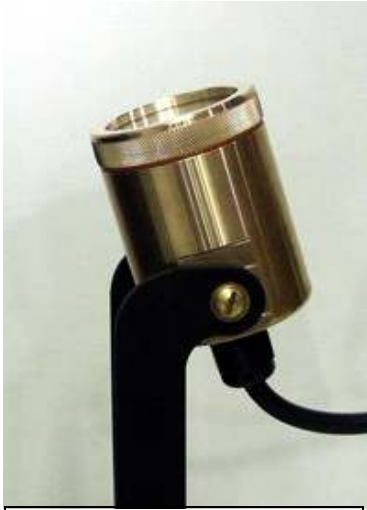
Bronze Light with Thermoplastic Mounting Bracket and Brass Screws