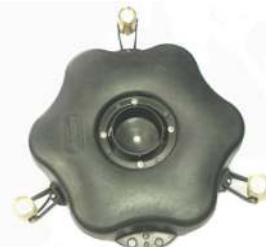
3 Light Orientation on Float