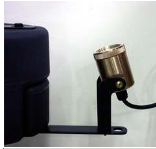
Bronze Light Attached to 3-Piece Float